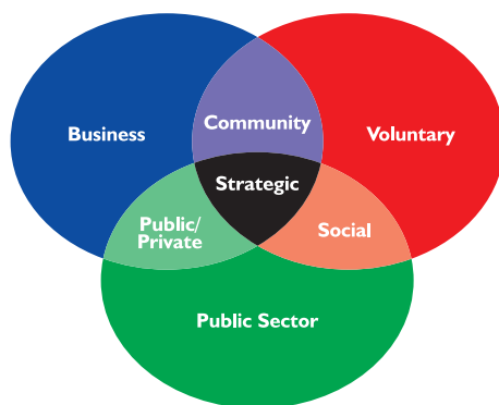
Figure 1 Multi-sectoral Partnerships

For our purposes we have taken a working definition of partnership as: a cross-sector, inter-organisational group, working together under some form of recognised governance, towards common goals which would be extremely difficult, if not impossible, to achieve if tackled by any single organisation. We have mainly been concerned with partnerships which are strategic in bringing together the public, private and community/voluntary sectors to address shared issues, e.g. in health, economic regeneration, education/skills, etc.