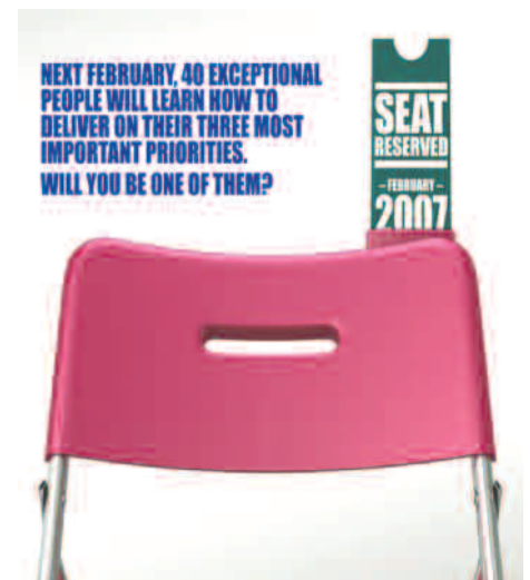
Whole Person Performance™

To make a positive difference in their organisations, leaders are required to consistently perform at their best - no mean feat in the complex chaotic and often uncertain world of business.